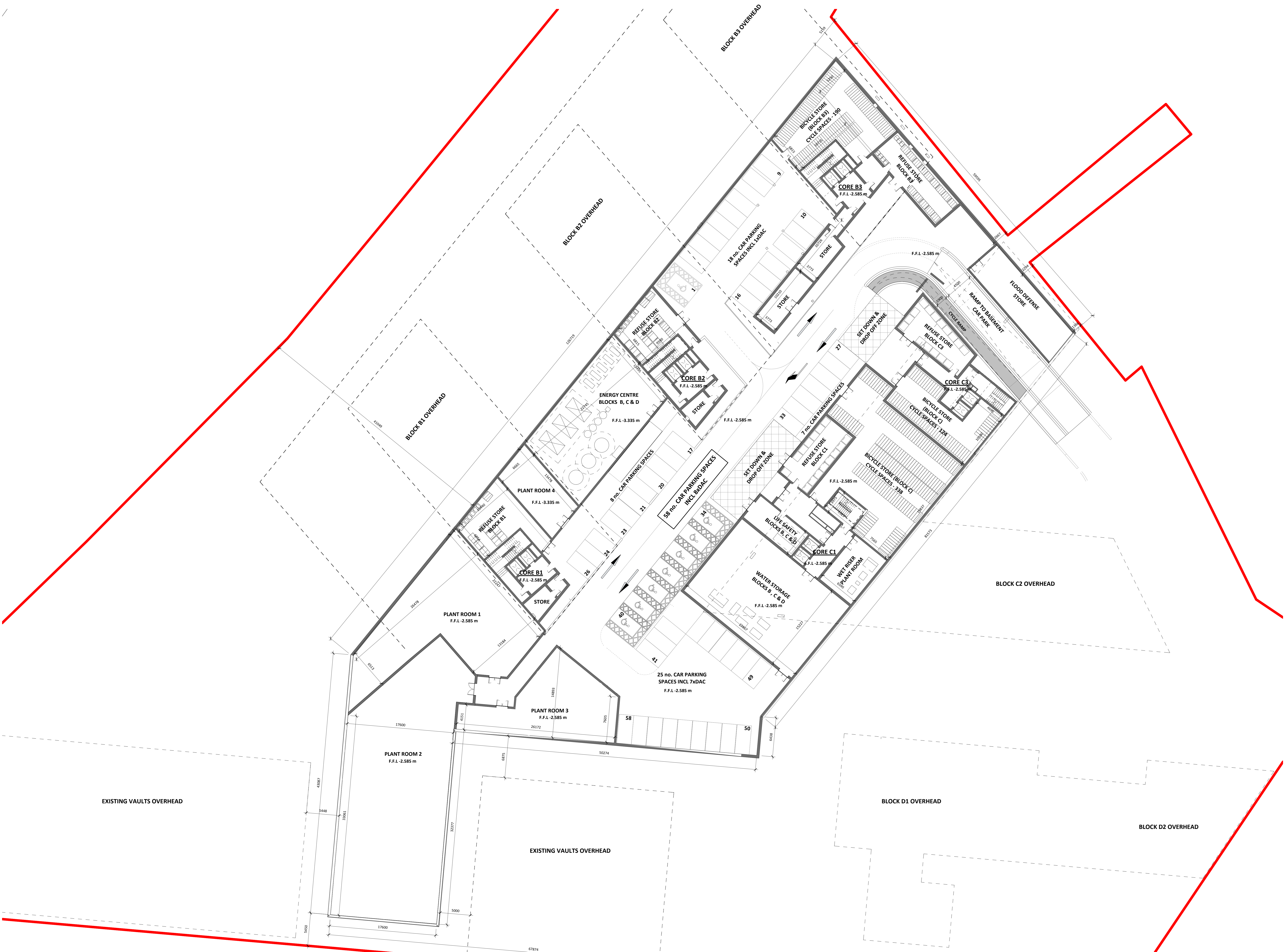
1 OVERALL BASEMENT PLAN_LEVEL B1